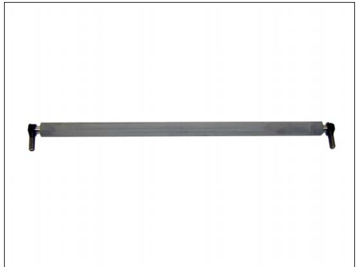
8. Clean the PCR holders with 99%pure isopropyl alcohol. Snap on to the ends of the PCR.