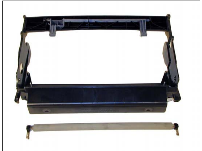
4. Carefully lift out the PCR. The PCR holders will most likely come out with the PCR. This is OK. It makes it easier to re-install it later. Be very careful not to touch the roller with your skin. As with any PCR, the oils naturally present in your skin will be absorbed by the roller and cause printing problems (extra marks on the page).