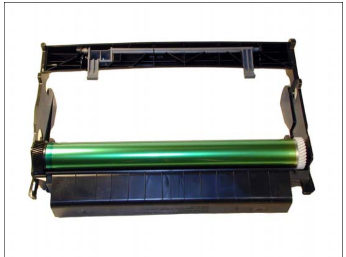
10. With the waste chamber facing you, install the drum so that the large gear is on the left side, spring on the small gear facing down.