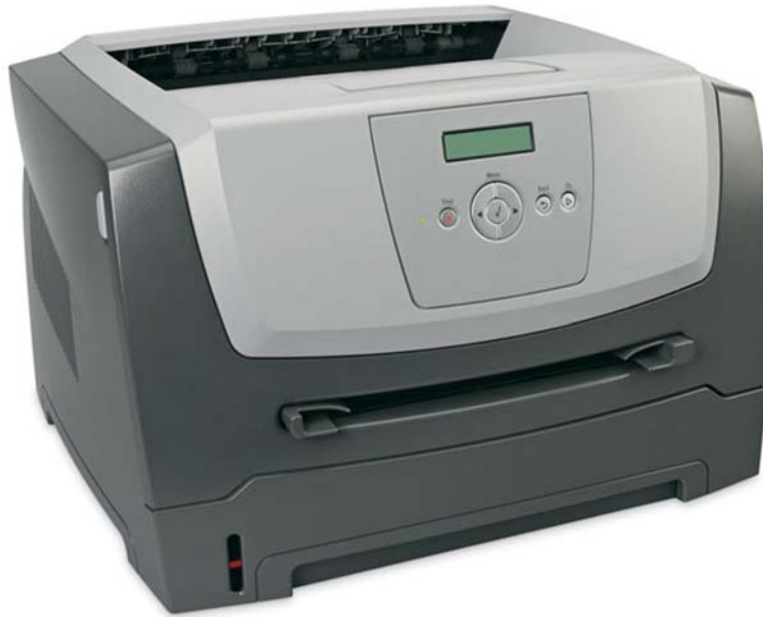
LEXMARK E450 LASER PRINTER