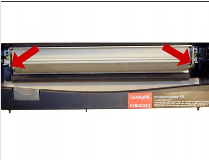
9. Install the PCR and holders.