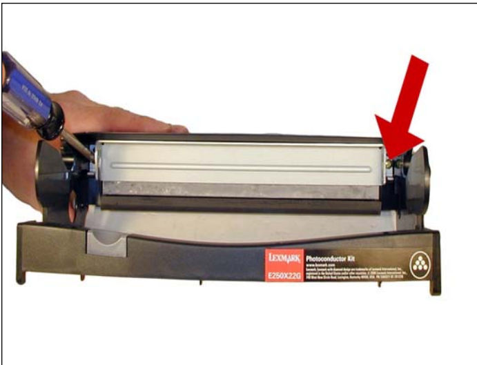
7. Install a new wiper blade coated with your preferred lubricant and two screws.