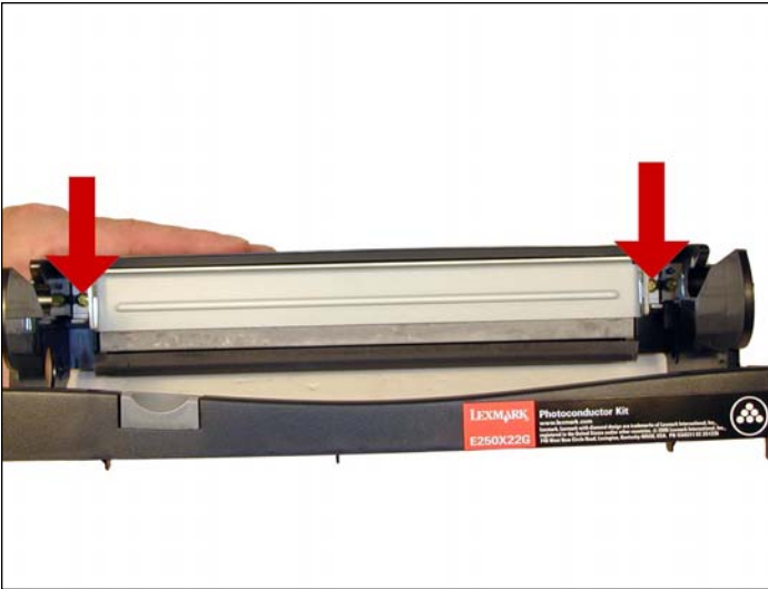
5. Remove the two screws from the wiper blade.