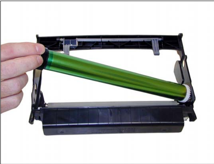
3. Carefully remove the drum.