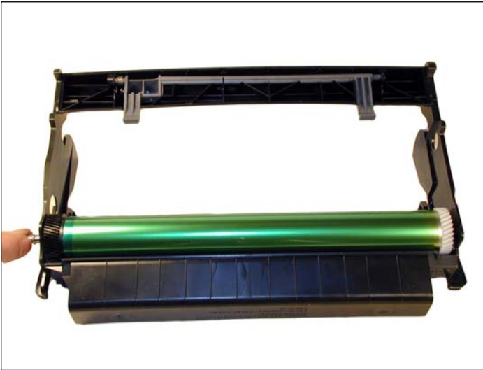
11. Install the drum axle from the large gear side.