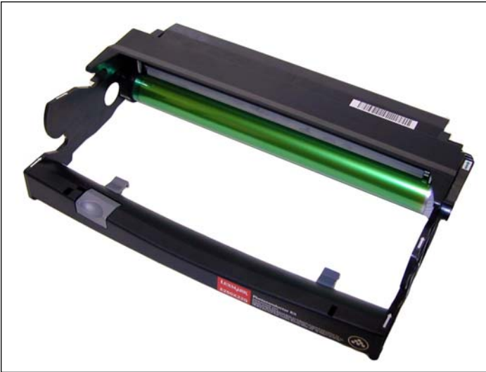
13. Just to make sure that everything is meshing properly and lubricated properly, rotate the drum by the large gear in the proper direction. This is always a good idea for drum units as a final check before installing the cartridge in your test machine.