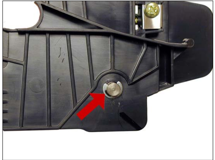
12. Install the E-ring on to the axle.