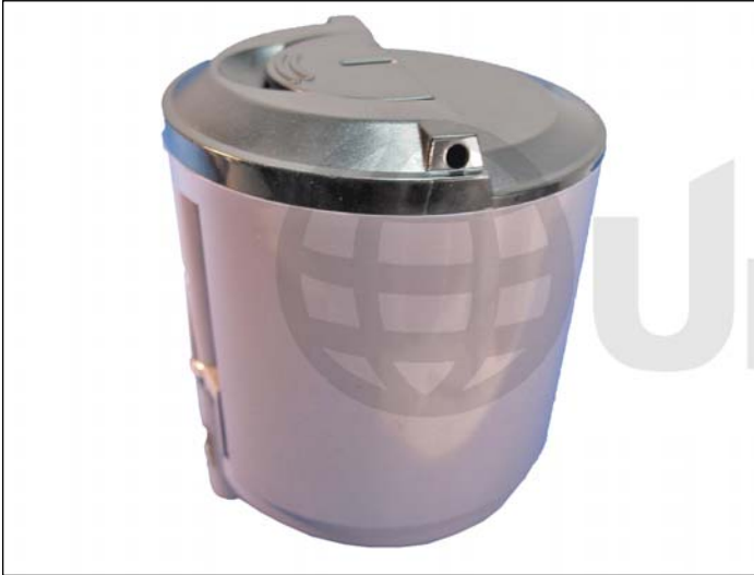
1. Samsung CLP-300 cartridge with front end cap.