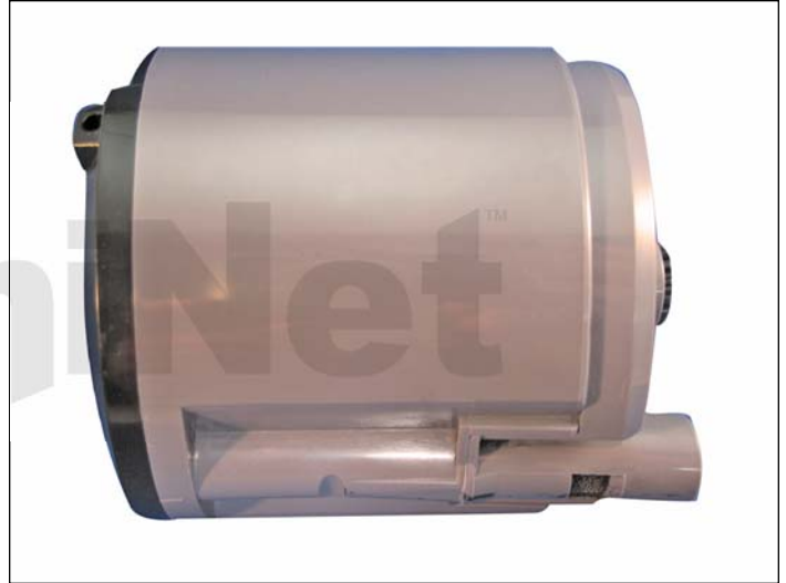
2. Side view of cartridge.