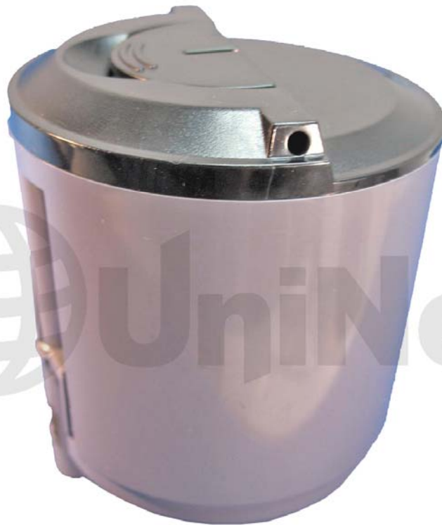
SAMSUNG® CLP-300 TONER CARTRIDGE