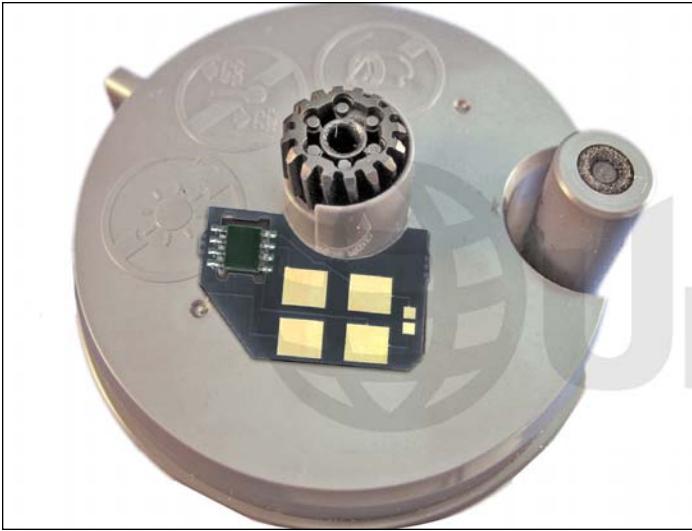
12. Ultra-thin C/M/Y/K replacement smartchips shown.

13. Peel off the strip to expose the adhesive on the reverse side of the ultra-thin chip. Apply the new chip over the OEM as shown. Remanufacturing complete.