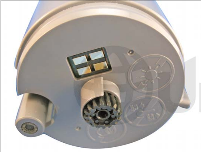
3. Gear side of cartridge with OEM chip.