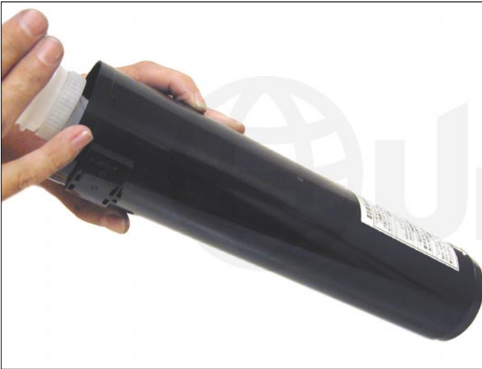
3. Vacuum the tube clean, and fill with new toner.