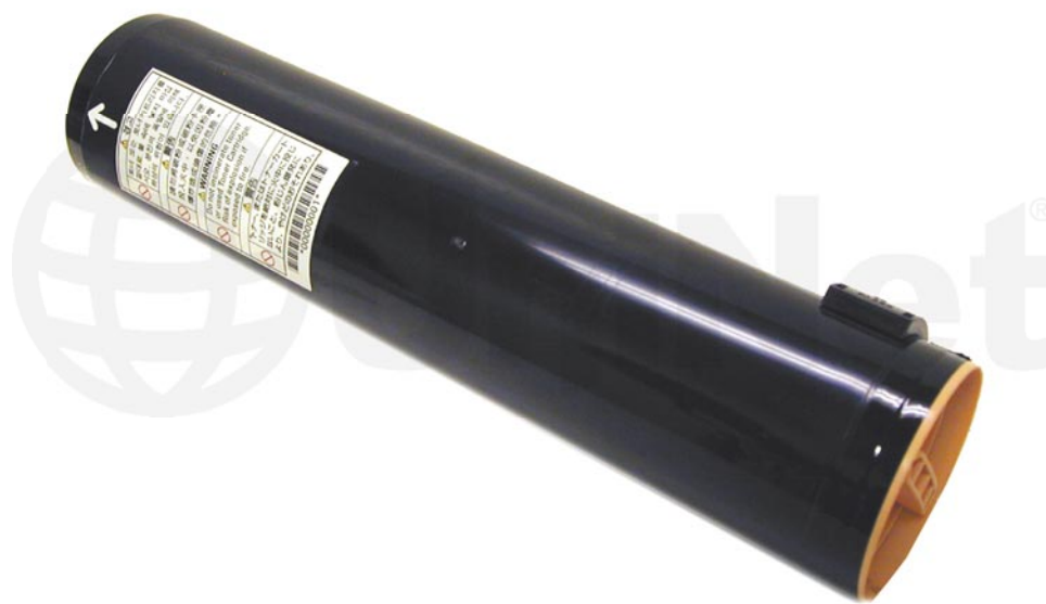
XEROX PHASER 7700 SERIES TONER CARTRIDGE