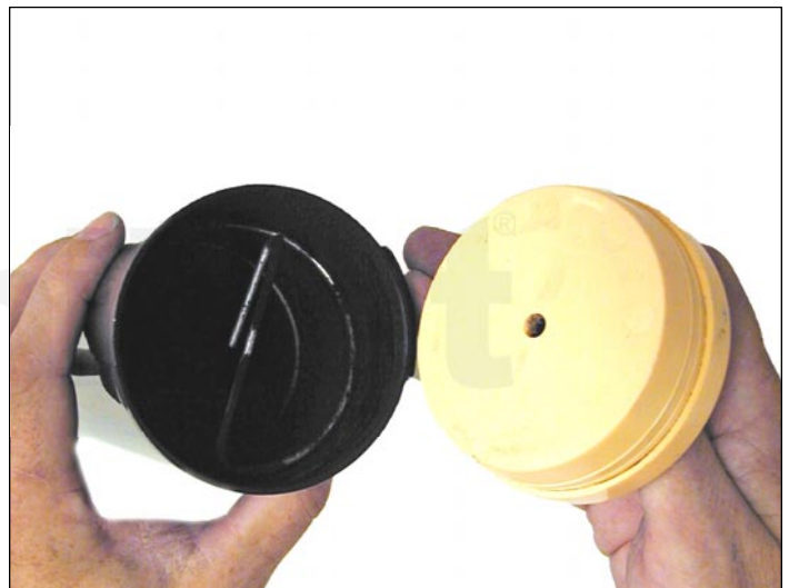
2. Remove the end cap.