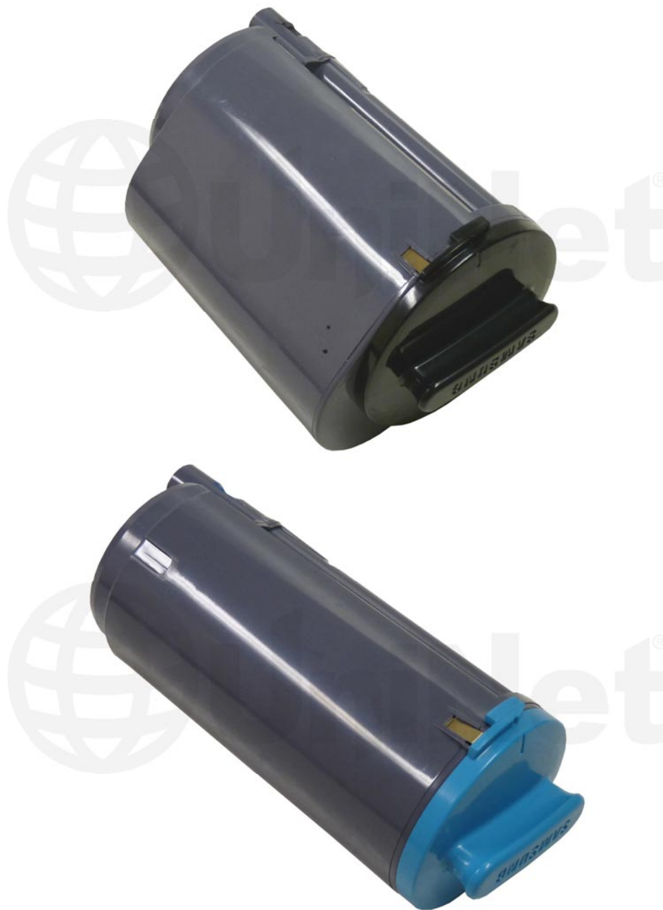
SAMSUNG CLP-350 SERIES TONER CARTRIDGE