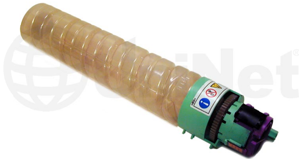
RICOH CL-4000 (TYPE 145) SERIES TONER CARTRIDGE