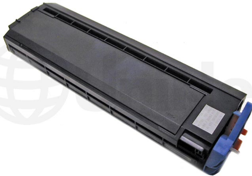
OKIDATA C9300 SERIES TONER CARTRIDGE