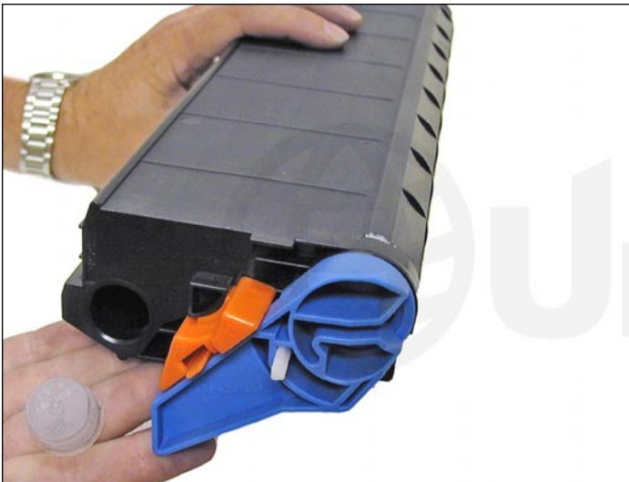
1. Remove the fill plug and clean out all remaining toner.

The Okidata C9300 series toner cartridges are rated for 15,000 pages at 5% coverage. They are compatible with the C9000, 9100, 9200, 9300 and C9500 machines. The OEM part numbers are the 41963604 Black, 41963603 Cyan, 41963603 Magenta, and 41963601 Yellow. There is no chip on the cartridge.