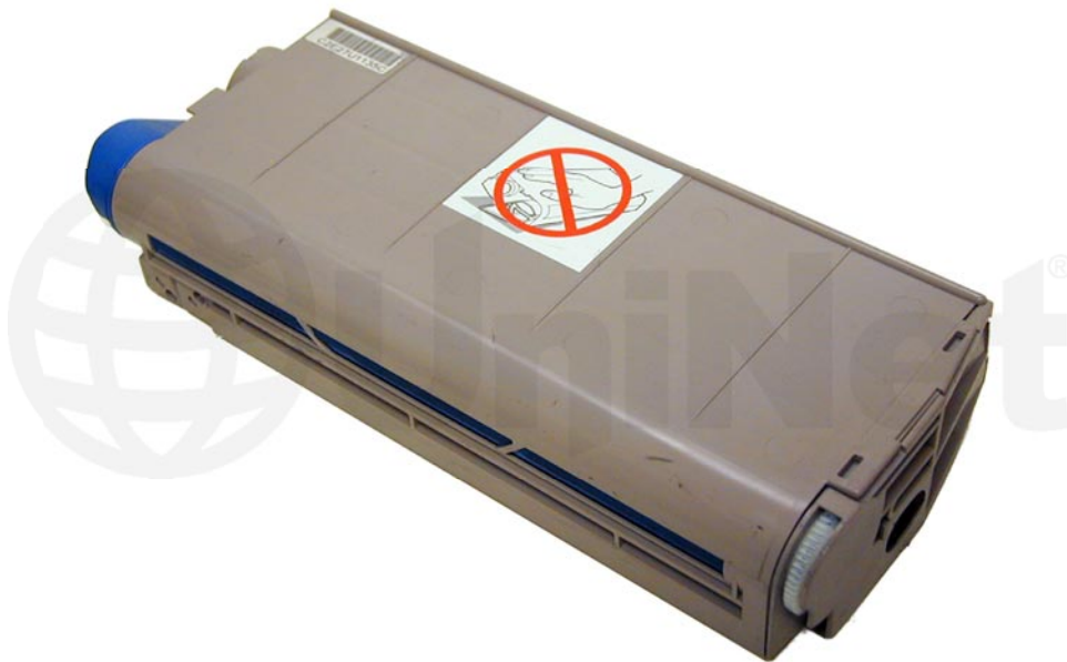
OKIDATA C7300 SERIES TONER CARTRIDGE