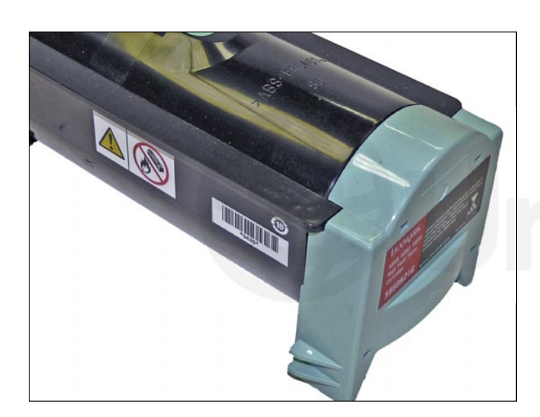
4. Install the end cap.