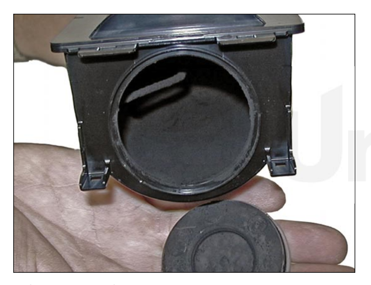
2. Remove the fill plug and clean out all remaining toner.