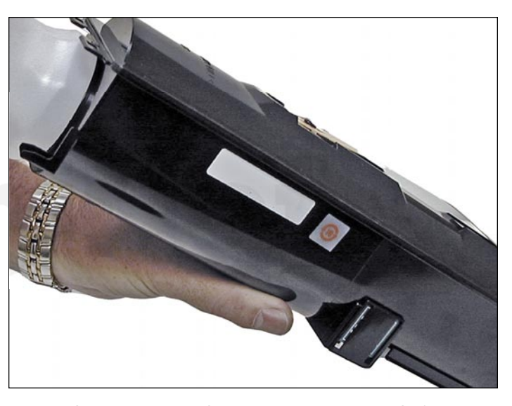
3. Fill with toner for use in the Lexmark X850.