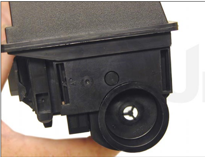
3. Re-install the fill plug.