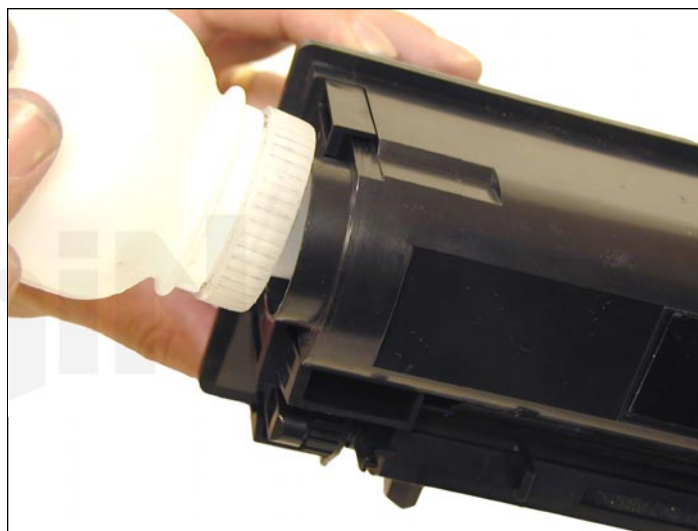
2. Make sure the toner port is closed.