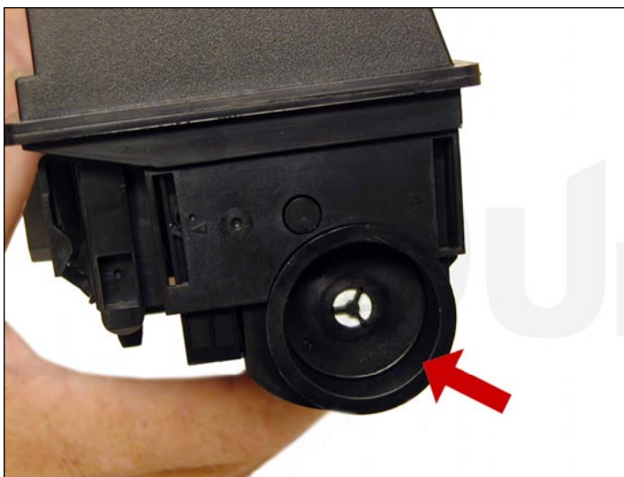
1. Remove the fill plug.

The Kyocera TK-332 series toner cartridges are used in the FS-4000. They are rated for 20,000 pages at 5% coverage. The toner cartridge sells with a waste toner bottle and a corona grid cleaner. There is a chip on the cartridge that must be replaced each cycle. The printer ships with starter toner cartridge rated at 10,000 pages. The supplies used in this cartridge are also compatible with the following toner cartridges: FS-2000 OEM TK-312 USA and TK-310 Europe rated at 12,000 pages, FS 3900 OEM TK-322 USA and TK-320 Europe rated at 15,000 pages, and FS 4000 OEM TK-332 USA / TK-330 Europe rated at 20,000 pages.