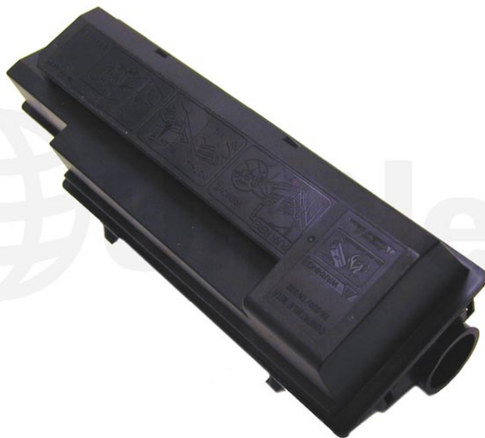
KYOCERA TK-332 SERIES TONER CARTRIDGE