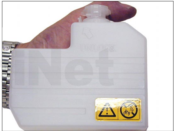
4. Clean out or replace the waste bottle.