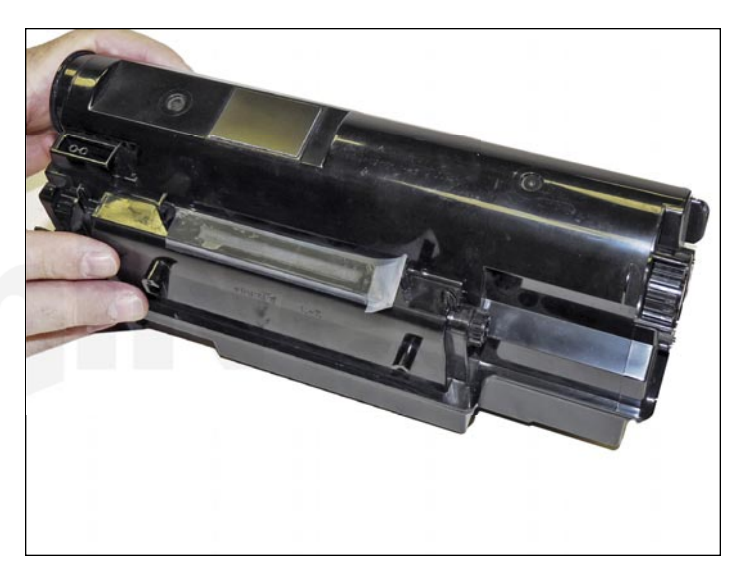
4. If shipping the cartridge, place a small strip of tape across the toner port.