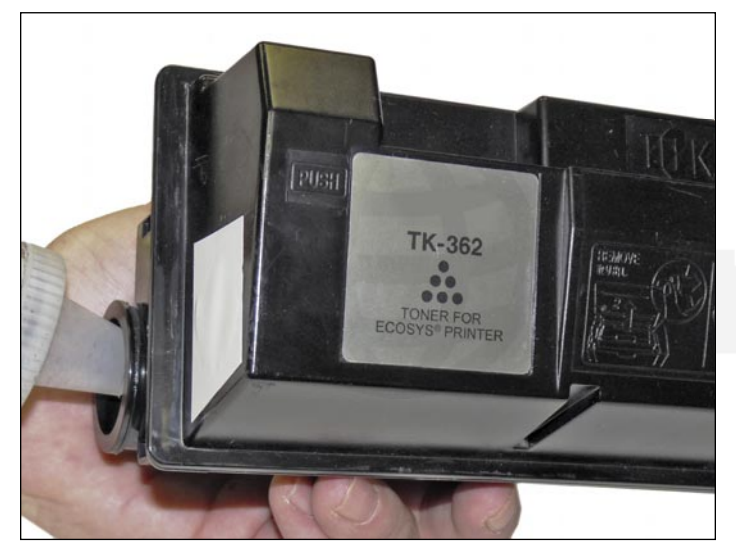
3. Fill the cartridge with toner for use in the TK-360 series of cartridges. Use a Samsung CLP-300 seal to cover the hole you drilled.