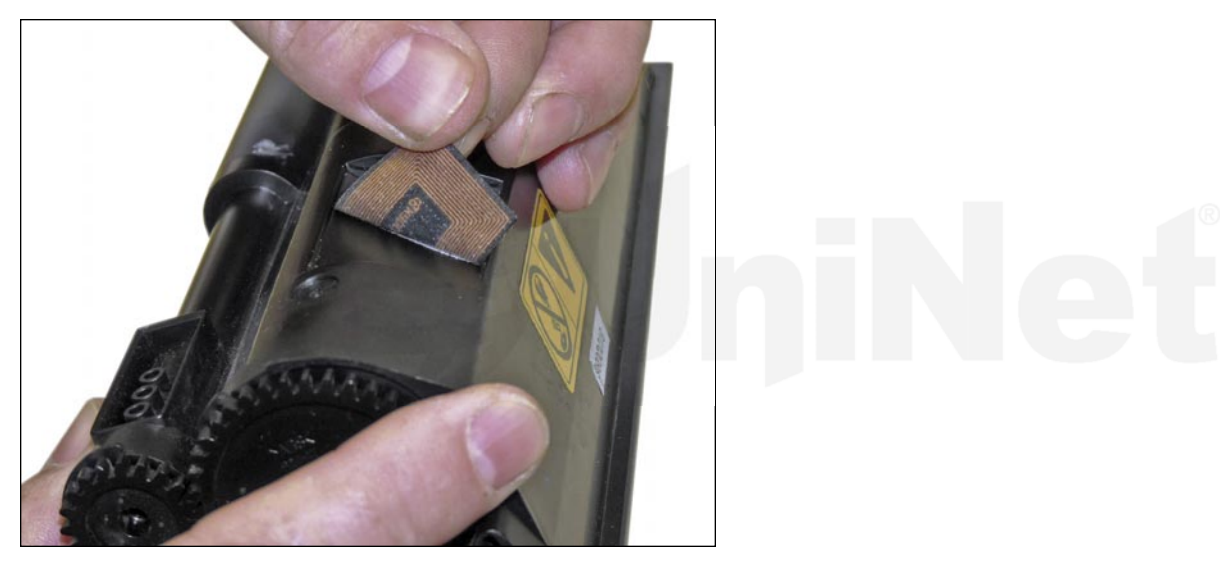
5. Peel off the old chip label (it is an RF type chip).