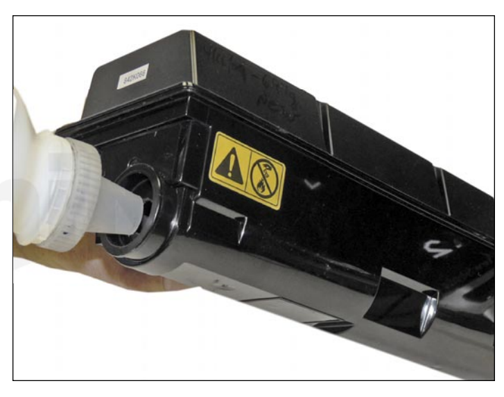
4. Fill the cartridge with toner for use in the TK-320 series of cartridges. Use a Samsung CLP-300 seal to cover the hole you drilled.