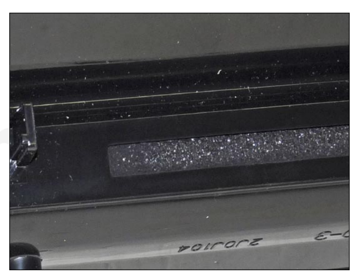
2. Make sure the toner port is closed.