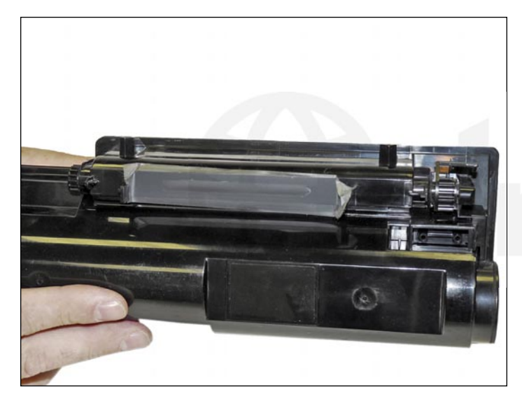
5. If shipping the cartridge, place a small strip of tape across the toner port.