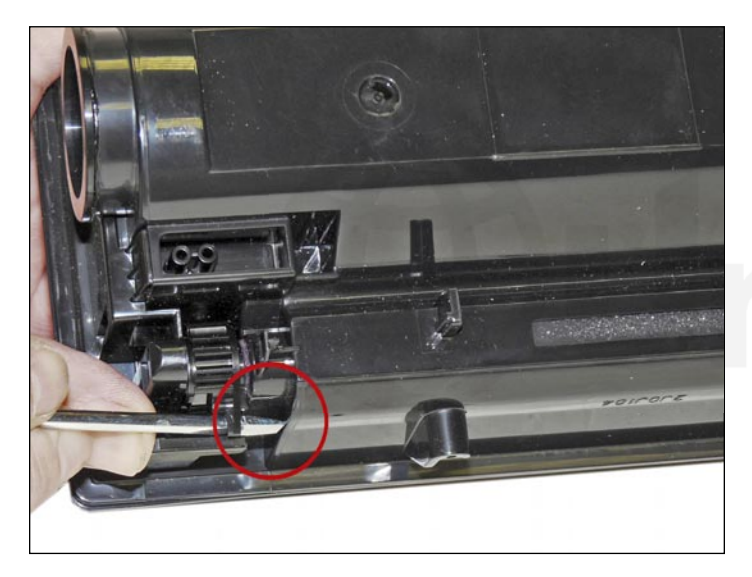
3. If open, close the port by turning a tab on the gear with a screwdriver.