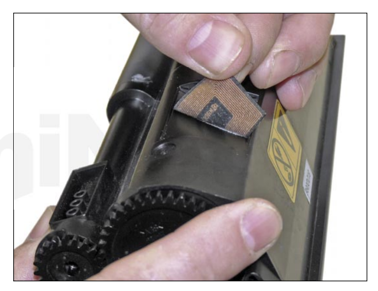
6. Peel off the old chip label (it is an RF type chip). Install the new chip label.