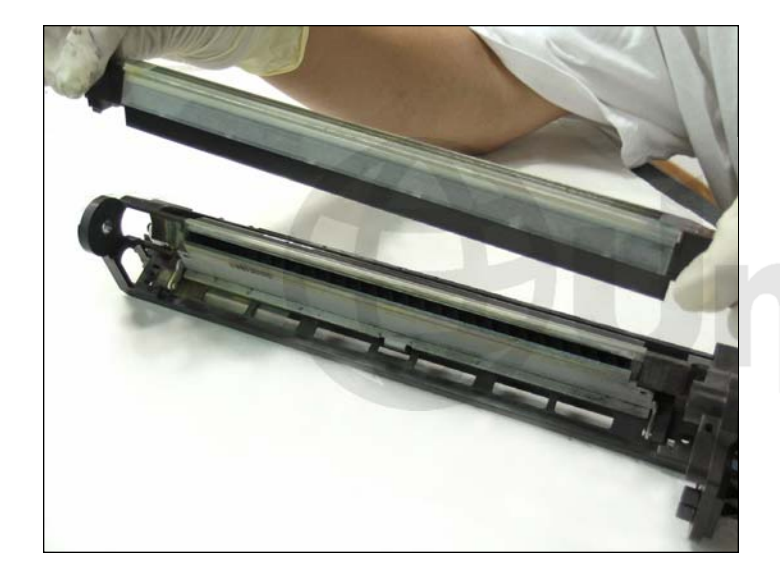
6. Remove the primary charge unit as shown.