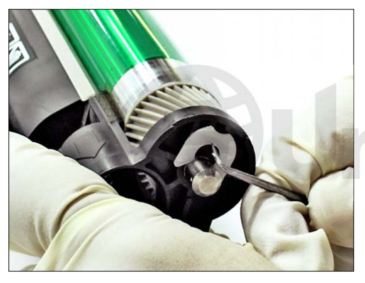
1. Remove the U-clip shown to unlock the drum axle using a small screwdriver or hook tool.