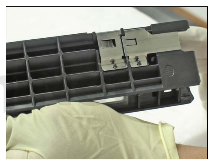
10. Locate the fuse behind the two metal contact plates on the back of the drum unit.