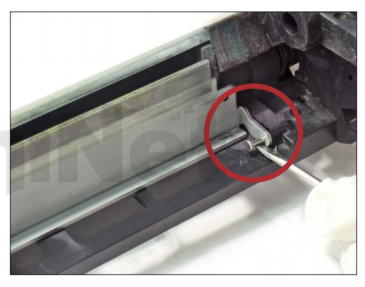
8. Use a flathead screwdriver to remove the two small pins that are holding down both ends of the wiper blade.