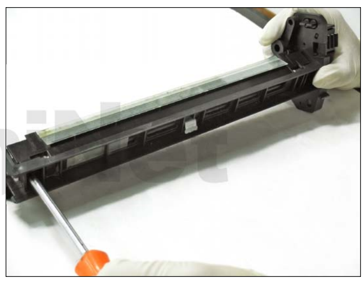
5. Locate and remove the two screws just below the drum unit.