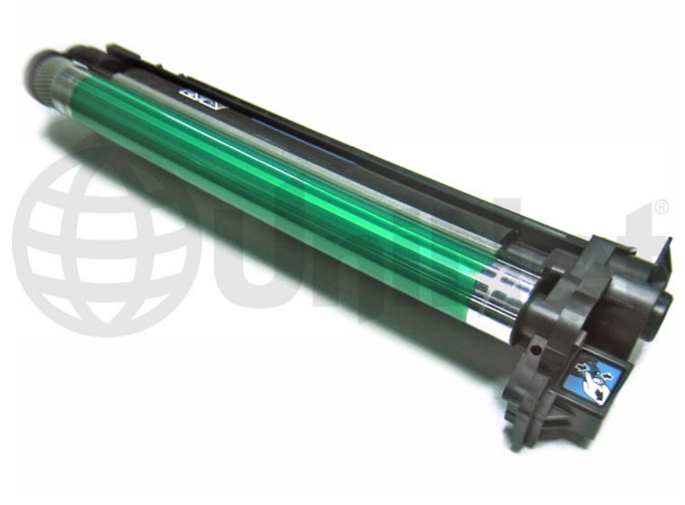
MINOLTA QMS MAGICOLOR 2300 DRUM UNIT