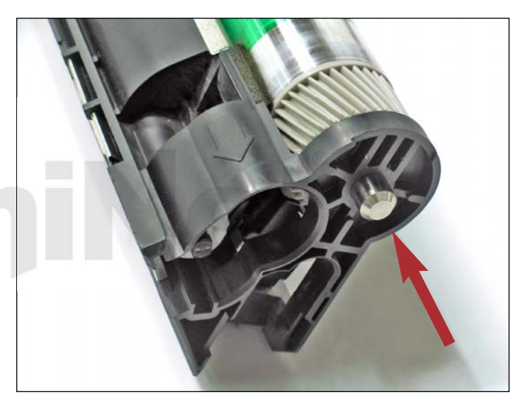
2. Push the axle in with your finger or tool so it comes out through the opposite end.