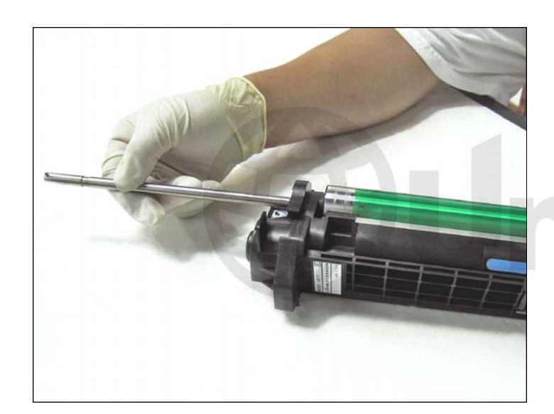
3. Carefully pull out the axle from the opposite end.