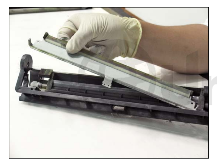
9. Remove the wiper blade and proceed to the cleaning process.