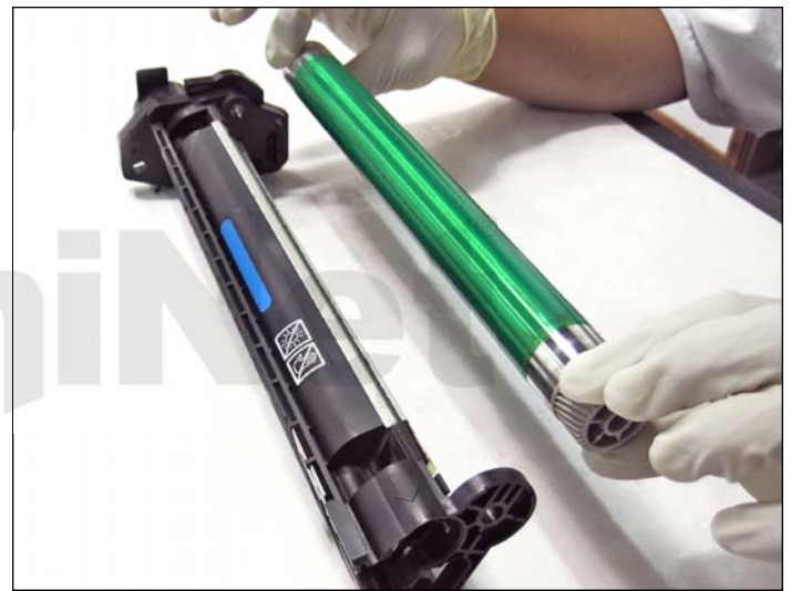
4. Carefully remove the drum as shown.