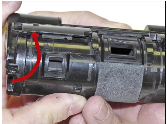
2. Slide the entire cover back to open up the ports.