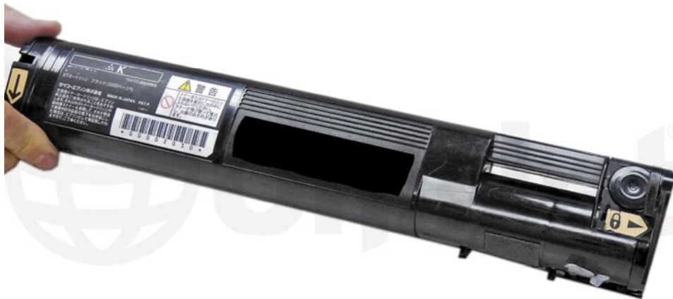
EPSON LP-S5000 TONER CARTRIDGE