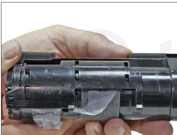
7. Slide the port cover back in place.