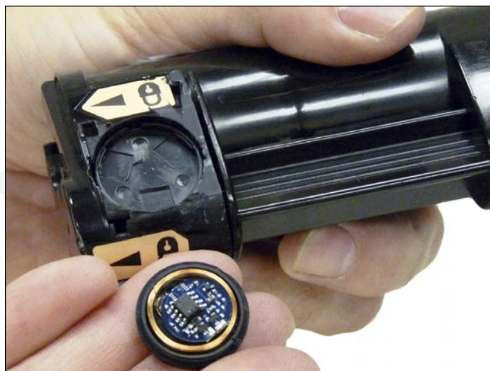
6. Pry up the chip cover, and then the chip from the end cap and replace.