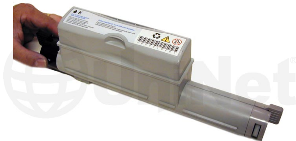
DELL 5110CN TONER CARTRIDGE