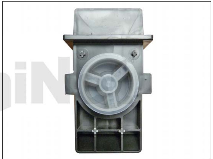
5. Remove the fill plug and clean out all remaining toner.