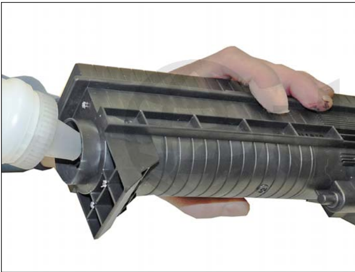
6. Fill the hopper with new Canon C3200 toner and replace the fill plug.