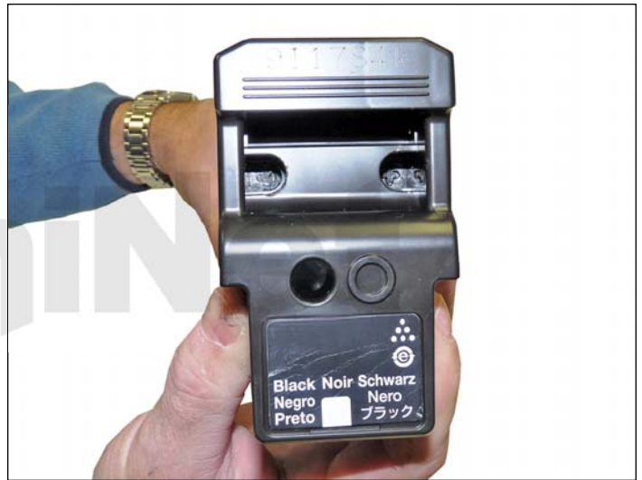
7. Install the end cap on the cartridge. An easy way to do this is to place four drops of hot glue on the four broken posts. Quickly place the end cap on before the glue dries. If further help is necessary to keep the end cap on, black tape along the seam works well.