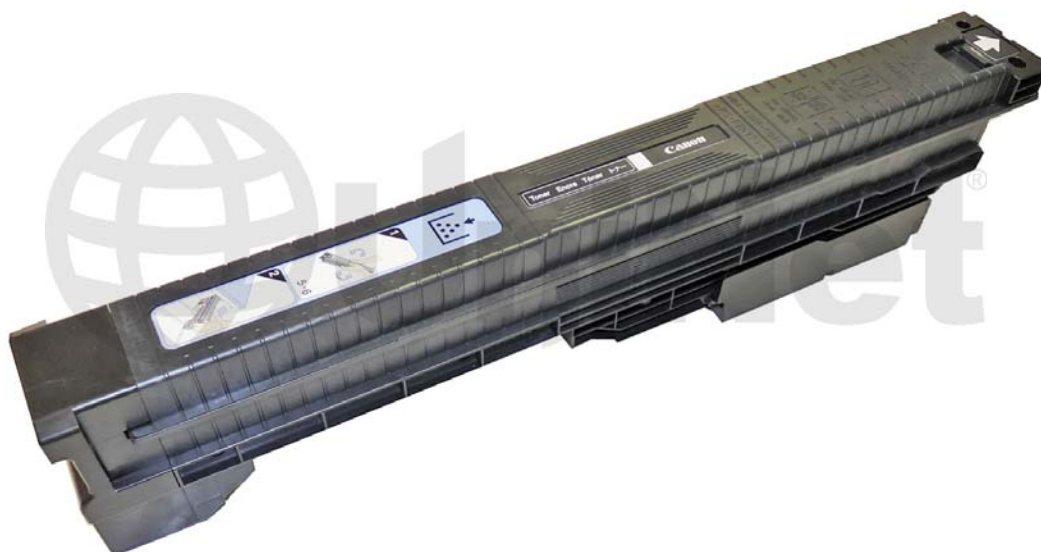
CANON IMAGERUNNER C3200 TONER CARTRIDGE