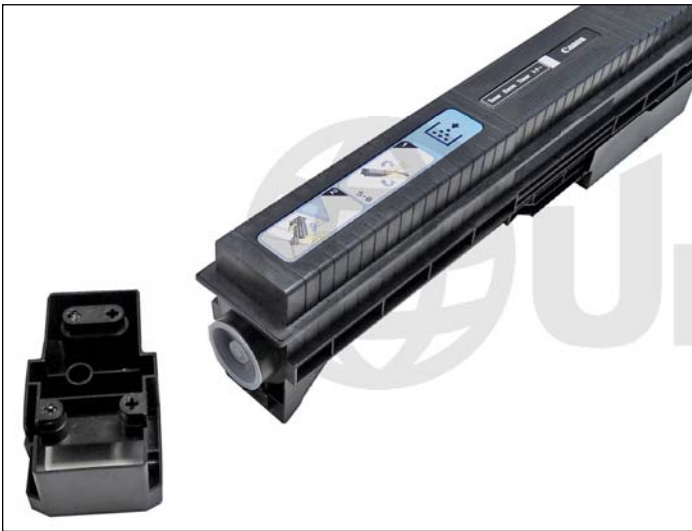
4. Remove the end cap.