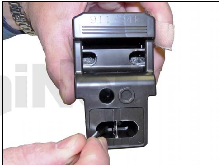
3. Remove the two remaining welds in the same manner as Step 1.