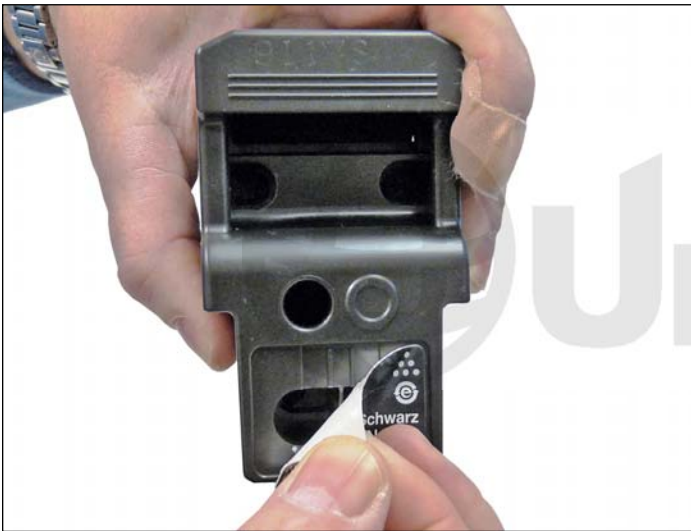
2. Remove the Cartridge ID label from the end cap.