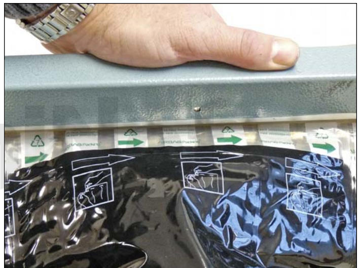
2. Heat seal the bag in the area indicated by the red line.

Do not use excessive heat. Just a short time interval works fine.