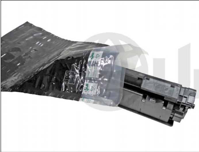
1. Place the cartridge in the correct size bag.