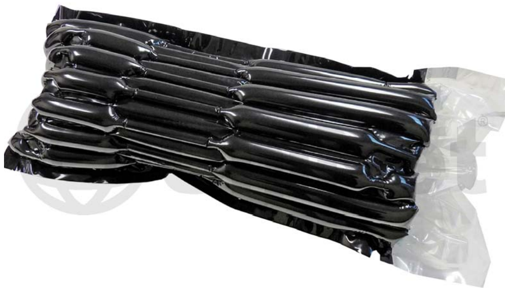
UNINET Q-TYPE (HEAT-SEAL) INFLATABLE AIRBAG